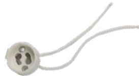
1PHB - GU10-GZ10