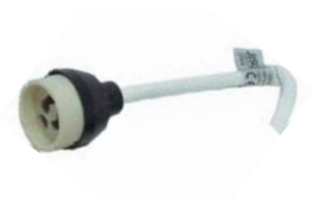
1PHG - GU10 100-240V