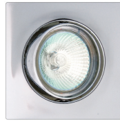
11 Cromo / Chrome / Chrome