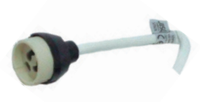
1PHG - GU10 100-240V