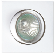
00 Blanco / White / Blanc