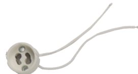
1PHB - GU10-GZ10