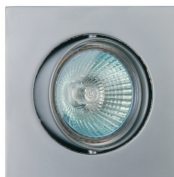
16 Cromo Mate / Matt Chrome / Chrome Mat