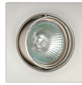
12 Niquel Satinado / Brus. Nickel / Nickel Satiné