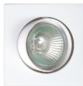
90 Blanco Técnico / Technical White / Blanc Technique